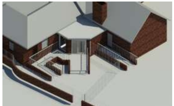
The improvements at the front of the site

I'd like to re-issue my invitation to any residents who would like a tour of West Felton CofE Primary School so that they can further their understanding of our site, our needs and our actual hopes for the future.