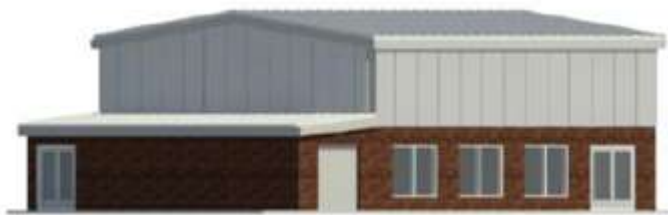
The hall at the exterior of the site

In terms of parking, we will step up our endeavours to improve the situation. We regularly remind parents to park considerately and The Punch Bowl has kindly re-issued its invitation for parents to park there. We will speak to local farmers, who always used to avoid the 30-minute pinch point at either end of the school day, to see if this is still a possibility. We'd hoped to establish a walking bus but struggled to staff this; we will look into this again to review its feasibility. I also have a meeting with our Safer School Advisor to discuss strategies we can use to reduce the issues.